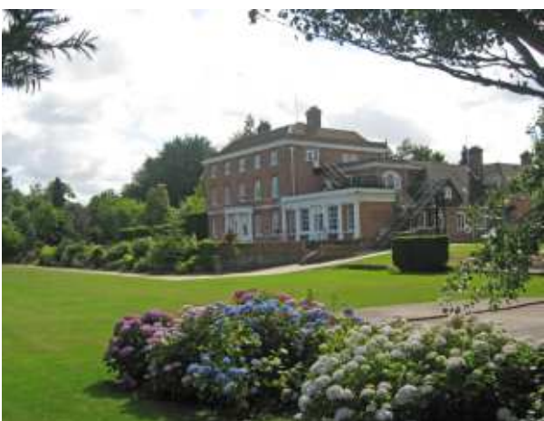
Historic East Court

THE Annual Town Meeting will take place at East Court on 23 April.