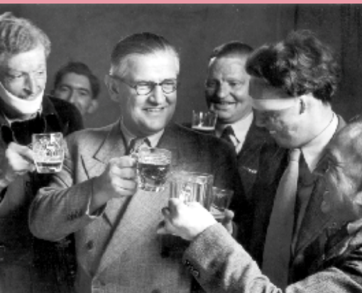
Sir Archibald McIndoe and friends

To learn more about the statue project visit www.mcindoememorial.com