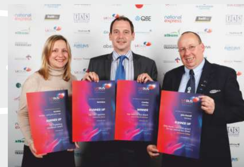
Metrobus award winners