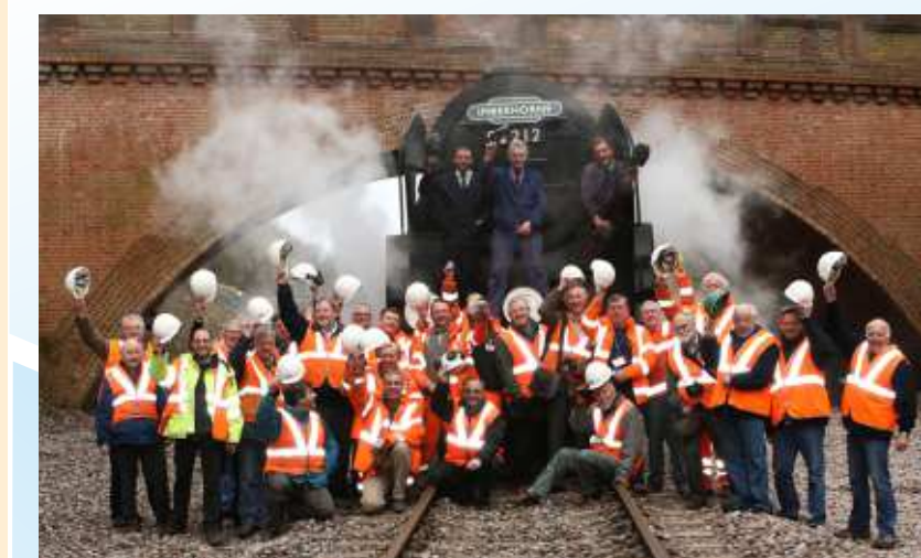
Construction workers and volunteers 'mend the gap'