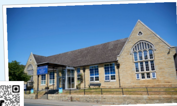
Chequer Mead Theatre

Chequer Mead is a truly valuable place; it brings the community together and fosters creativity. We have so many ideas and dreams for Chequer Mead as we want to fulfil the incredible potential we know this special place has. Please help us make our dreams a reality by spreading the word about our charity and donating if you can.