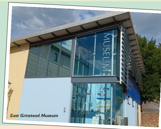
East Grinstead Museum