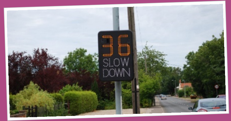
Example SID in action

Previously, the Council joined a shared ownership scheme with the parishes of West Hoathly, Balcombe, Worth, Turners Hill and Ashurst Wood. The new acquisition will mean that the town can deploy the device to a wider range of locations and for longer periods of time. The Council will also continue to be part of the shared scheme, which will allow greater coverage across the town.