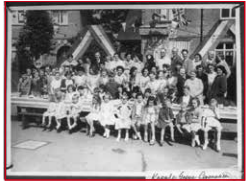
Knole Grove Celebrations (East Grinstead Museum)