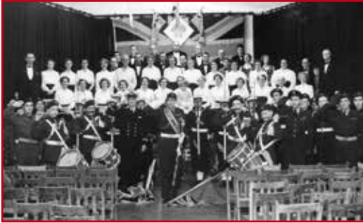
East Grinstead Choral Society (East Grinstead Museum)