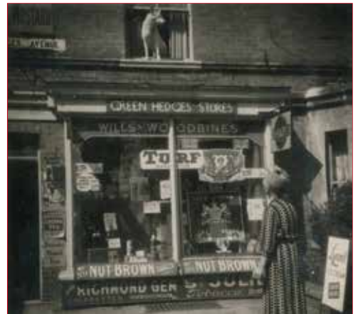
Green Hedges Stores