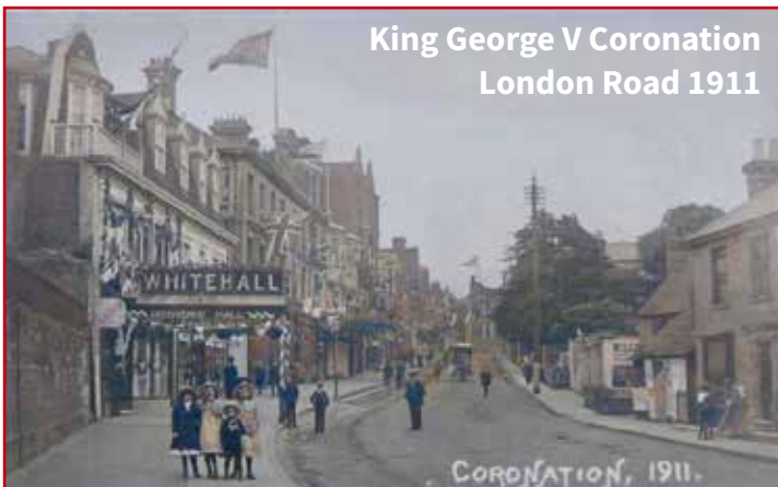
King George V Coronation London Road 1911