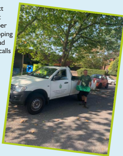
Food pick-up from Waitrose