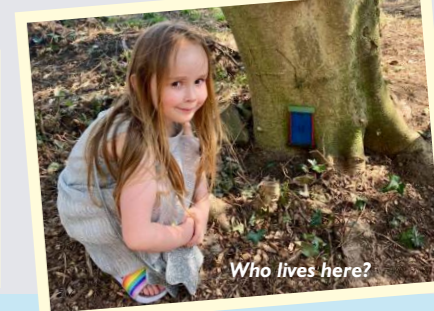
Who lives here?