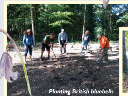
Planting British bluebells

It hasn't taken long for the fairies to move in, so why not take a wander through our special trail? Who knows what you'll find if you go into our woods today!