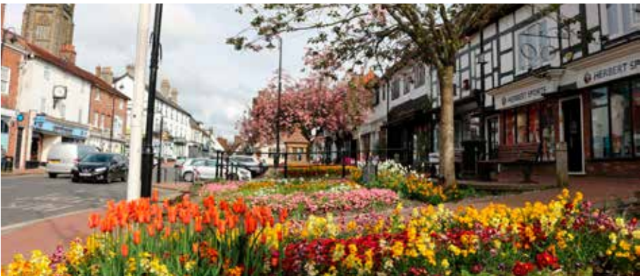
Floral displays in the High Street

Lyrics to the carol 'Good King Wenceslas' were written here by John Mason Neale. His tomb can be seen within the grounds of St Swithun's Church along with memorial stones to three Protestant