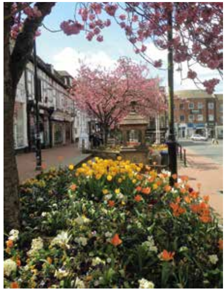
High Street flower beds

The beds are re planted three times a year with winter, spring and summer bedding plants supplied by Ferrings Nursery. Summer planting is themed by