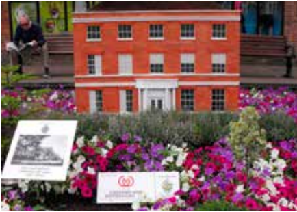
250th anniversary of East Court

The High St Flower Beds have become a much admired feature of the town in recent years and have been managed by the Town Council since 2012.