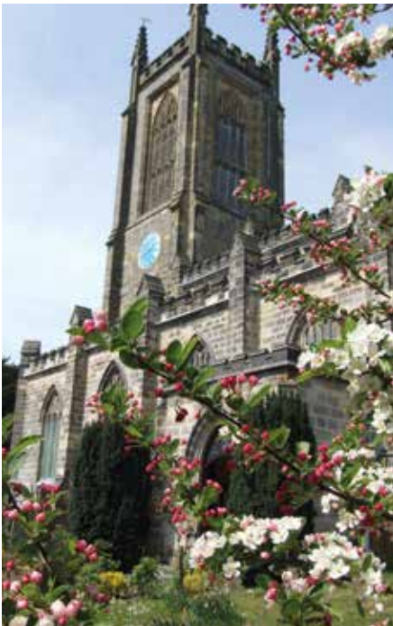
St Swithun's Church