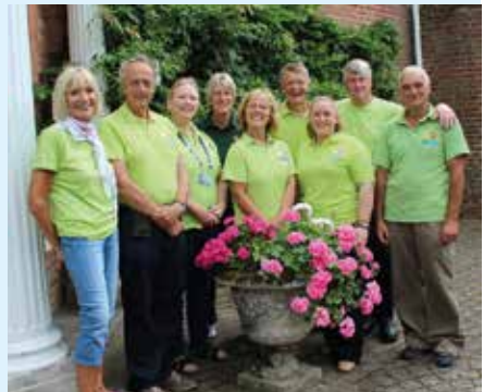
East Grinstead in Bloom committee