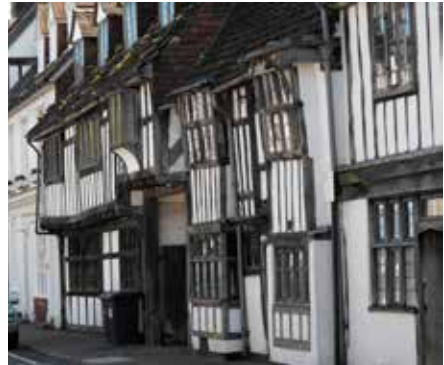
East Grinstead historic High Street

open hall houses dating from the Medieval and Tudor times 15th and 16th centuries. There are splendid examples from Georgian and Regency times too with an interesting mix of independent shops, bars and cafes.