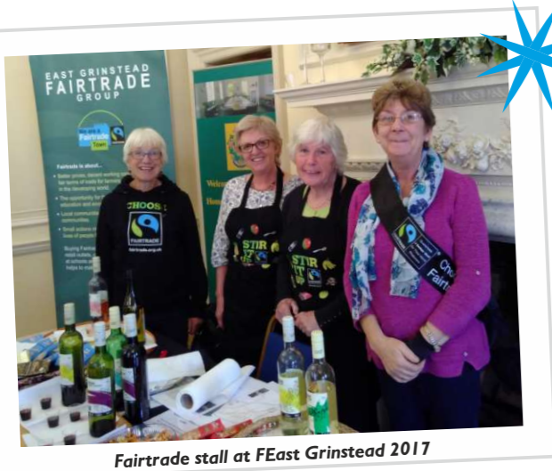
Fairtrade stall at East Grinstead 2017