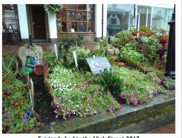
Fairtrade bed in the High Street 2017