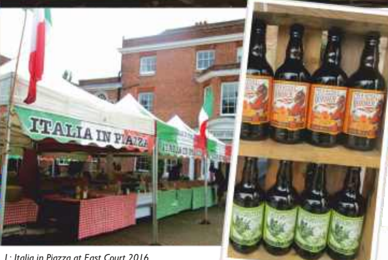
L: Italia in Piazza at East Court 2016 R: High Weald Brewery

tourism@eastgrinstead.gov.uk www.eastgrinstead.gov.uk/projects/feast-grinstead