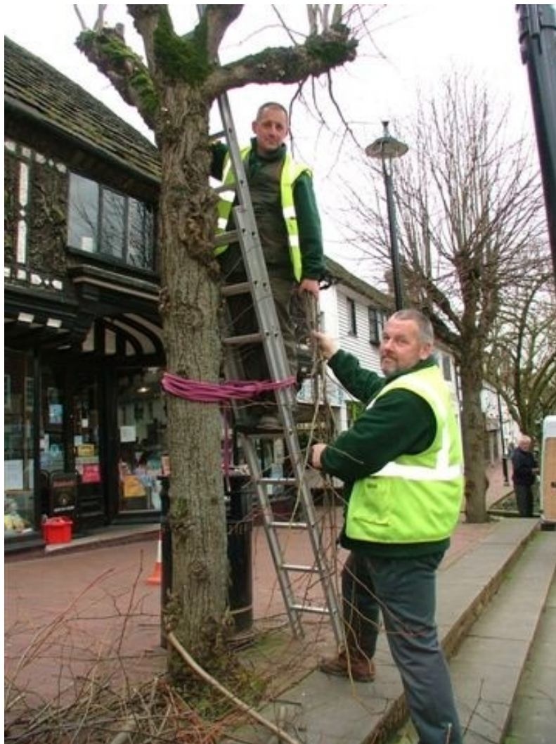
Amenities Team in action