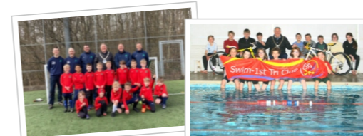
L: East Grinstead Meads Football Club R: Swim 1st Junior Triathlon Club

The grounds are here for all, so bring a picnic and enjoy the views across Ashdown Forest and beyond.