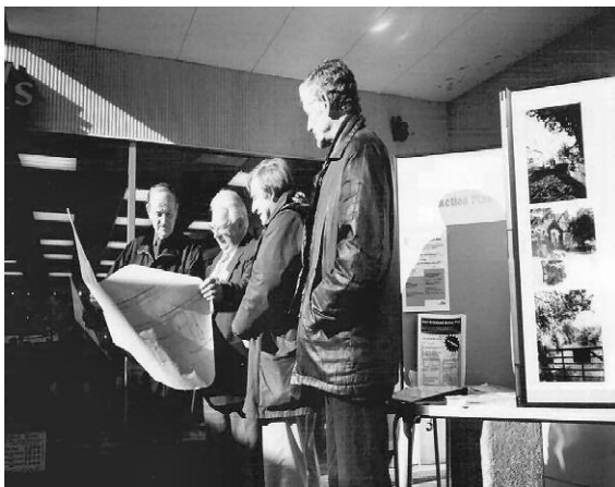
East Grinstead Healthcheck – Consultation Day